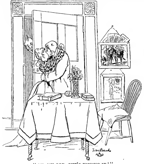
"OH, MY GOD, SHE'S KISSING IT!"

different result another time, he judged. He said to himself, with a deep sense of injury, "He'll put in his diary—they all keep diaries—he'll put in his diary that she was miraculously uninteresting-dear, dear, but wasn't she!—I never saw the like—and yet looking as